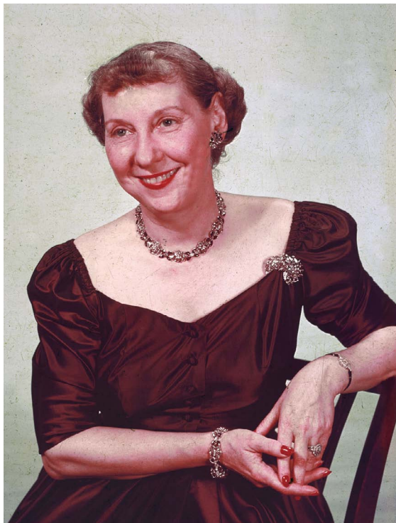
Mamie Geneva Doud Eisenhower November 14, 1896 - November 1, 1979 Wife of President Dwight D. Eisenhower