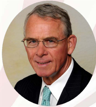
Francis Rooney U.S. Congressman Dist. 19