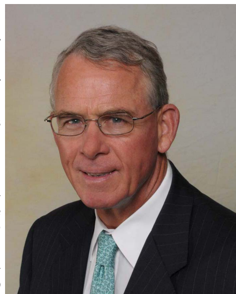
Francis Rooney US House of Representatives

Background: Congressman Rooney has testified four times on water quality issues. In addition to this testimony, the Florida Congressional delegation has signed a letter, led by Congressman Rooney, that was sent to President Trump. This letter called on the President to support Everglades Restoration projects in his fiscal year 2018 Budget and included the signatures of all Florida Congressmen. Congressman Rooney is also a member of the Everglades Caucus.